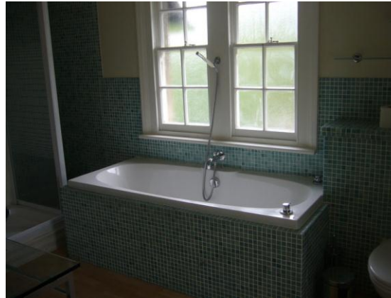
Bathroom – 31 st August 2011