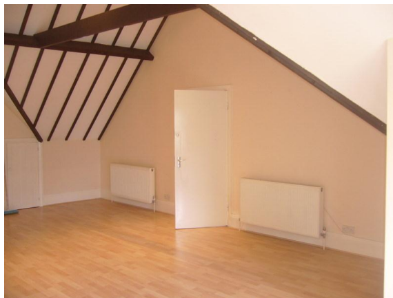
Lounge – 31 st August 2011