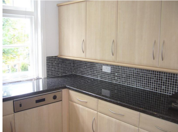
Kitchen – 31 st August 2011