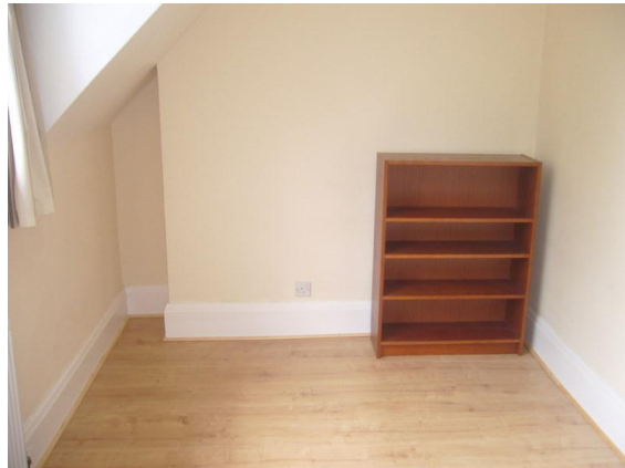
Bedroom One – 31 st August 2011