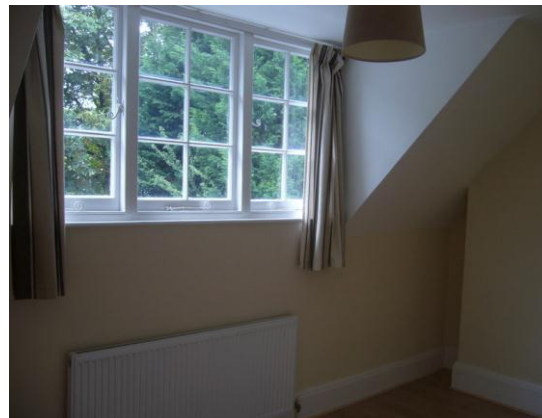
Bedroom One – 31 st August 2011