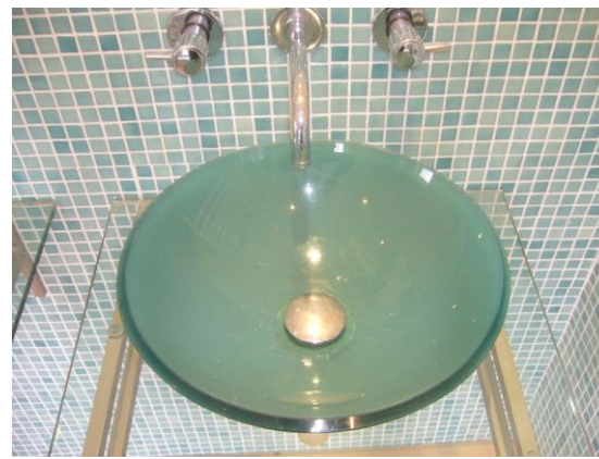
Bathroom – 31 st August 2011