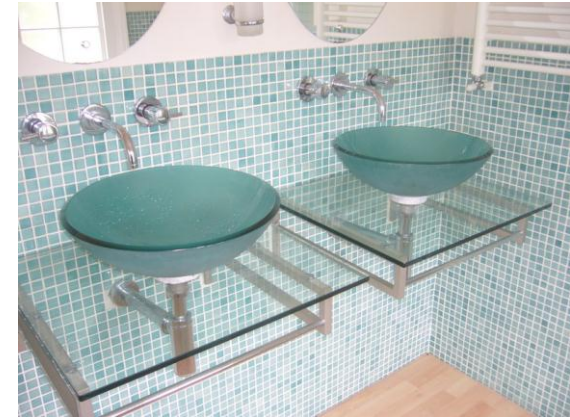
Bathroom – 31 st August 2011