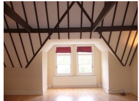
Lounge – 31 st August 2011