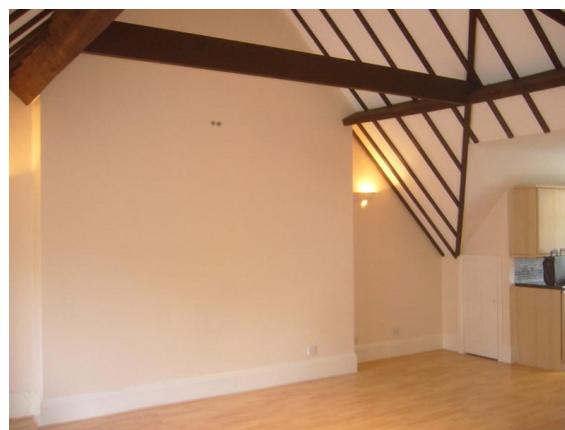
Lounge – 31 st August 2011