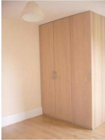
Bedroom Two – 31 st August 2011