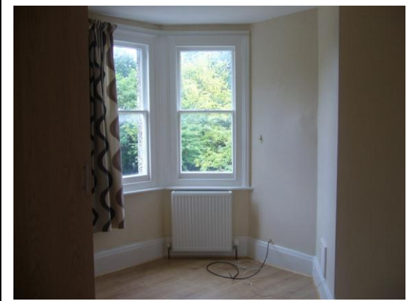
Bedroom Two – 31 st August 2011