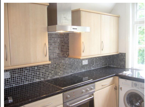
Kitchen – 31 st August 2011