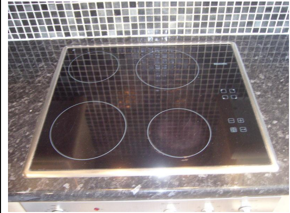
Baumatic hob – 31 st August 2011