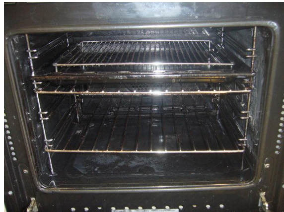
Single oven – 31 st August 2011