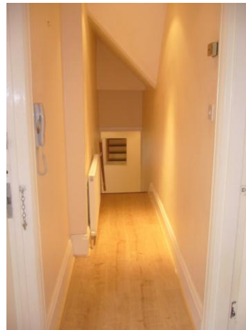
Hallway – 31 st August 2011