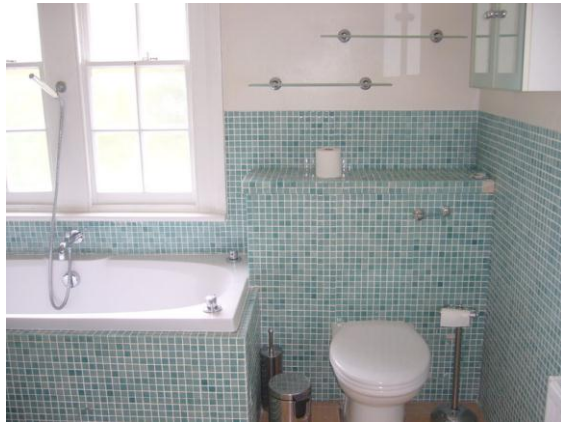
Bathroom – 31 st August 2011