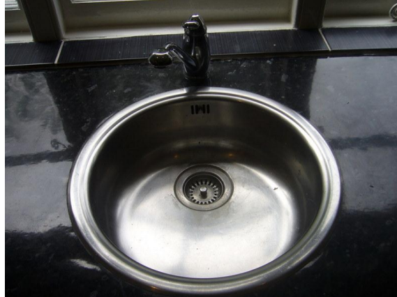
Kitchen – 31 st August 2011